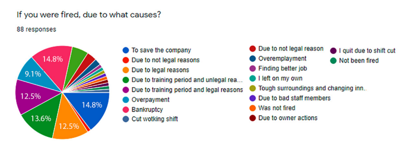
Figure 4. Causes of losing a workplace or getting laid off