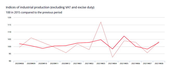
Figure 2. Profitability drop

More than 3 million euros were spent on improving the economy and its stability, as well as a plan to reduce the spread of the Covid-19 virus, which aroused concerns. 42,4 million euros were allocated to other needs, with 11 million euros going to expenses unrelated to the virus or the pandemic. The Covid-19 laws hurt non-food traditional retail the most, including firms without an internet presence, travel, tourism, and hospitality. In 2020, at than 40 airlines went bankrupt, with others clinging to life thanks to government aid. International tourism rates are expected to drop by 74% by 2020, resulting in a revenue loss of USD 910 billion to USD 1.2 trillion. Profits in the fashion industry have plummeted year over year, with estimates estimating a nearly 90 percent loss (Tesch & Way, 2021).